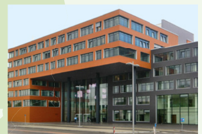
main building 10 (Evonik)

→ Please register in the main building 10 (Evonik) of the Industriepark Wolfgang on arrival.